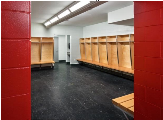
New arena dressing rooms