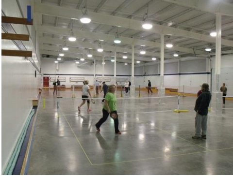
Curling Rink Dry Floor