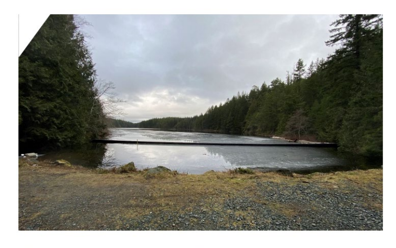
Stocking Lake Dam Remediation Preliminary Design