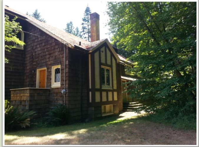
Back View of the Chapel