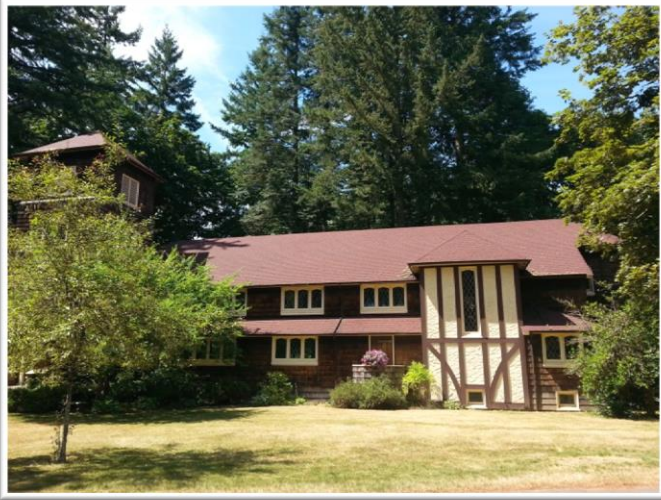
Front View of the Chapel