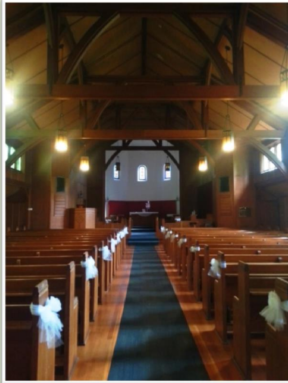
View towards the Altar