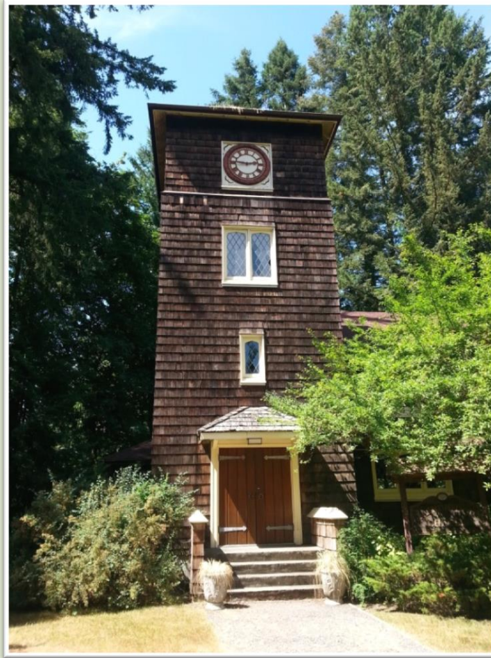
Front View of Clock Turret