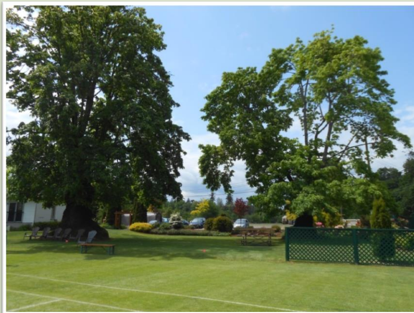
View of the Mature Maple Trees