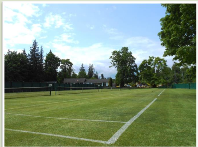
South Facing View of Grass Courts