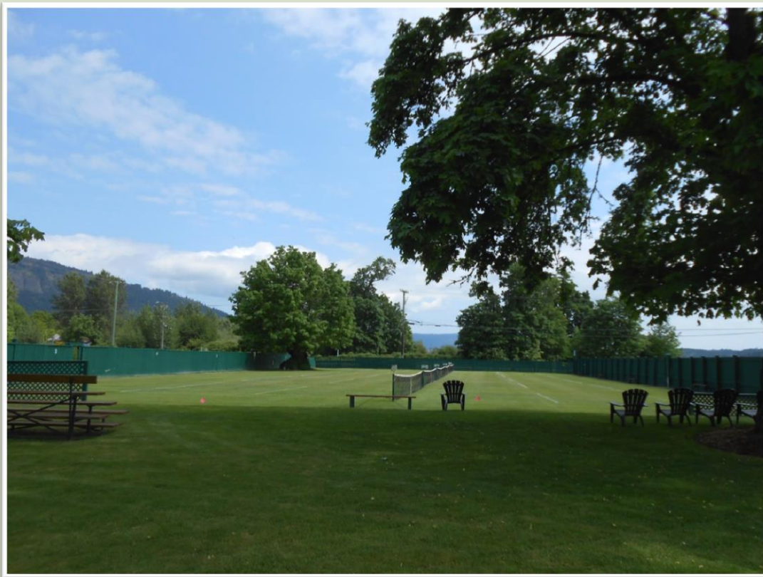
View of Grass Courts and Cowichan Bay