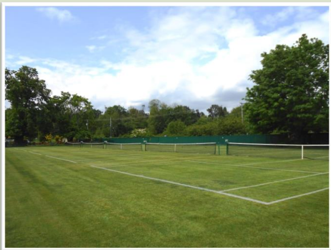
North Facing View of Grass Courts